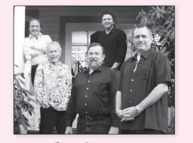
The Queazles (N) Tuesday, July 17, 7:30 p.m.

Get ready for the sounds of the Lovin' Spoonful, the Kinks, the Beatles, the Flamingos, the Eagles, and much more as the Queazles, a five-man band from Huntington, perform the greatest songs of the 50s, 60s, and 70s. You won't want to miss this trip back to the golden days of Rock 'n' Roll as The Queazles duplicate the original vocal harmonies of these famous groups. In the event of rain, the concert will be held in the Library's Community Room and NENPL Library Card holders will be seated first.