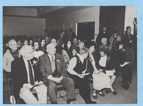
More than 150 people enjoyed the special presentation "In Celebration of Libraries."