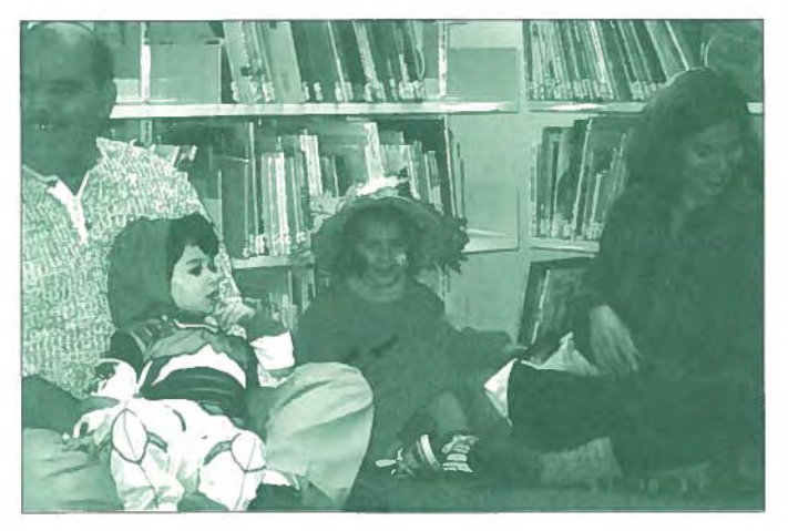
Goblins, ghosts, princesses, cats, bugs — and even an M&M — showed up for Halloween storytime at the library. Children enjoyed some spooky stories and then stopped by the Library Cafe for a yummy treat.